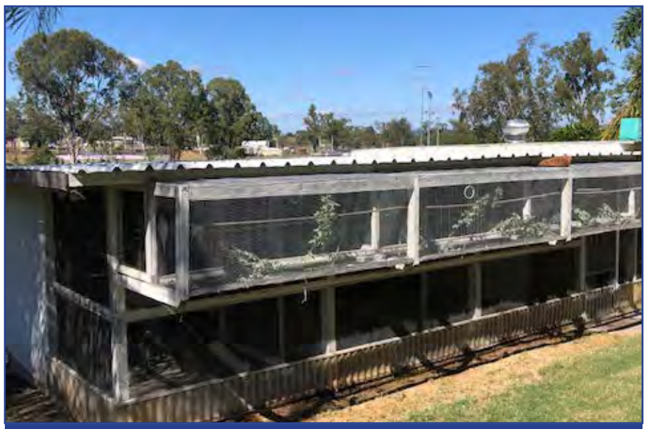
Outside view of Gary's impressive Budgerigar aviary and breeding room

let stand for at least twelve hours before feeding out. The breeder's soft food mix I make comprises boiled egg, sprouted mung beans, corn from a tin, grated carrot and beetroot, this is fed most days. All the vitamins and medication I use come from the vet Rob Marshall in Sydney, whom I have been using for years.