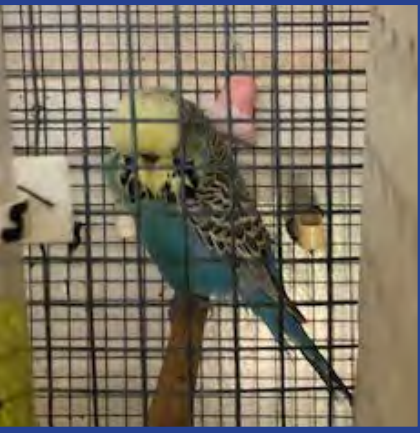
Outstanding Yellow Face Cinnamon Blue of Gary's currently in breeding cage, hopefully filling eggs.