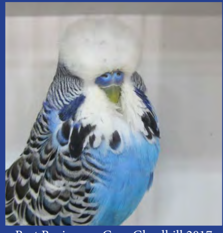
Best Beginner - Gary Gleadhill 2017 CBS YB Selection Show