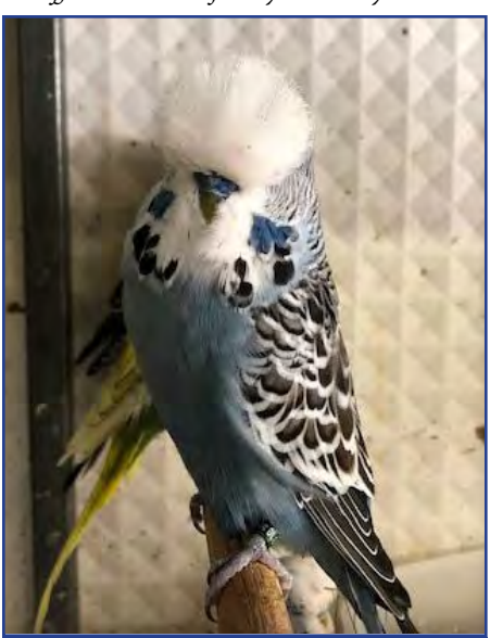
A nice Grey male Gary is sending to this years CBS auction

Do you believe that the birds breed better at different times of the year? Do you have