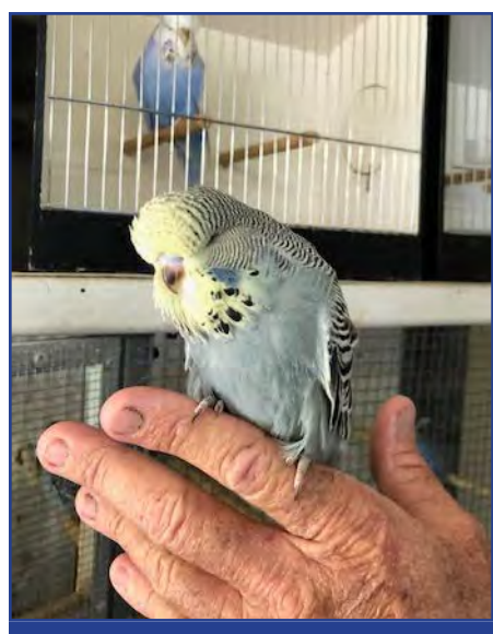
Yellow Face Grey looking very promising from this season