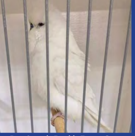
Best Spangle Double Factor Gary Gleadhill 2019 CBS Breeders Show