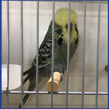
Best Yellow Faced Gary Gleadhill 2018 CBS 50th Anniversary Annual Show