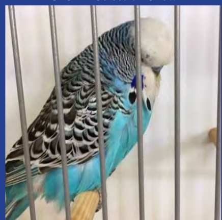
Best Normal Blue Gary Gleadhill 2019 CBS Breeders Show