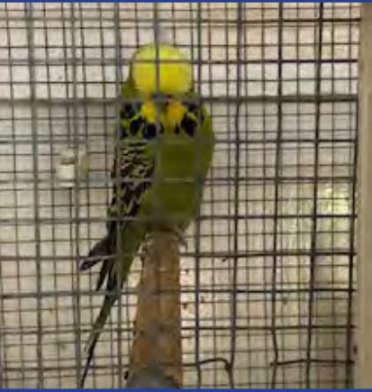
Powerful Grey Green of Gary's in breeding cage