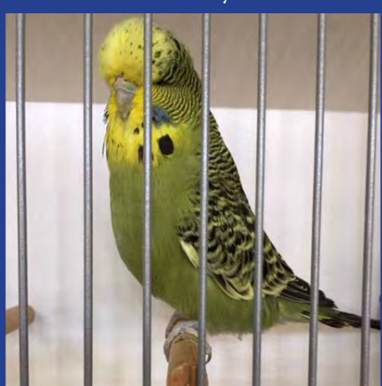
Opposite Sex of Show, Champion Young Hen, Champion Young Bird of Show Best Grey Green 2019 CBS Breeders Show