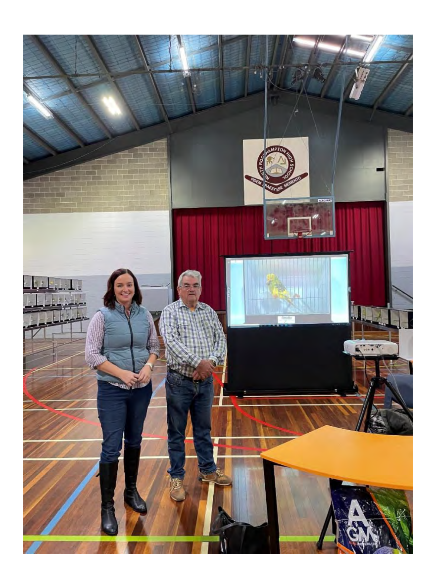
The Handover with some of the Equipment shown operating.